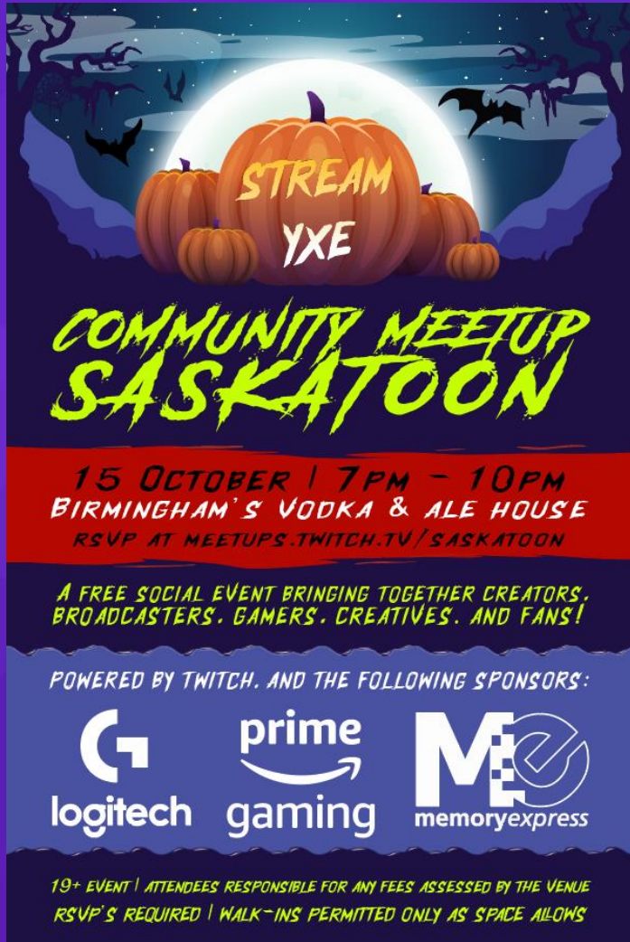
POSTERS PLACED AROUND THE CITY