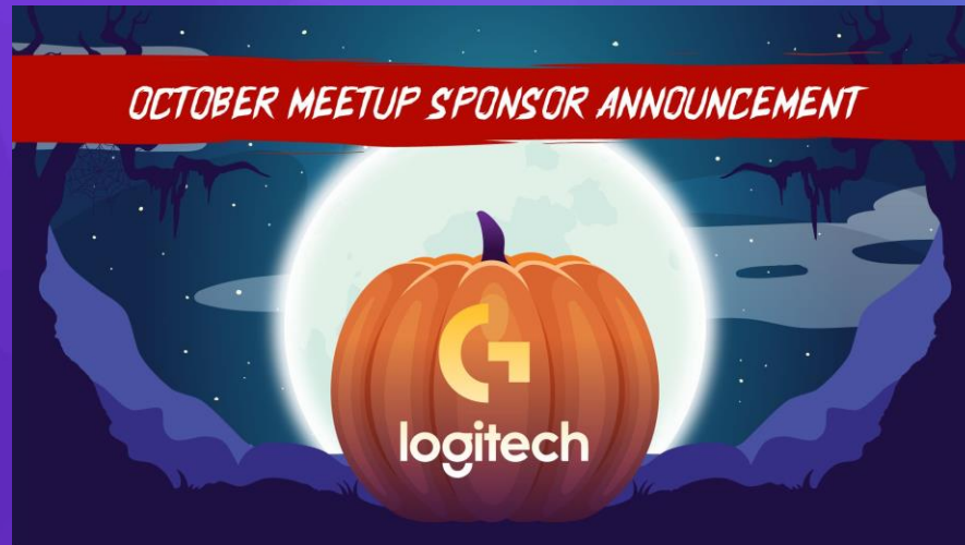
TWITTER ANNOUNCEMENT GRAPHIC